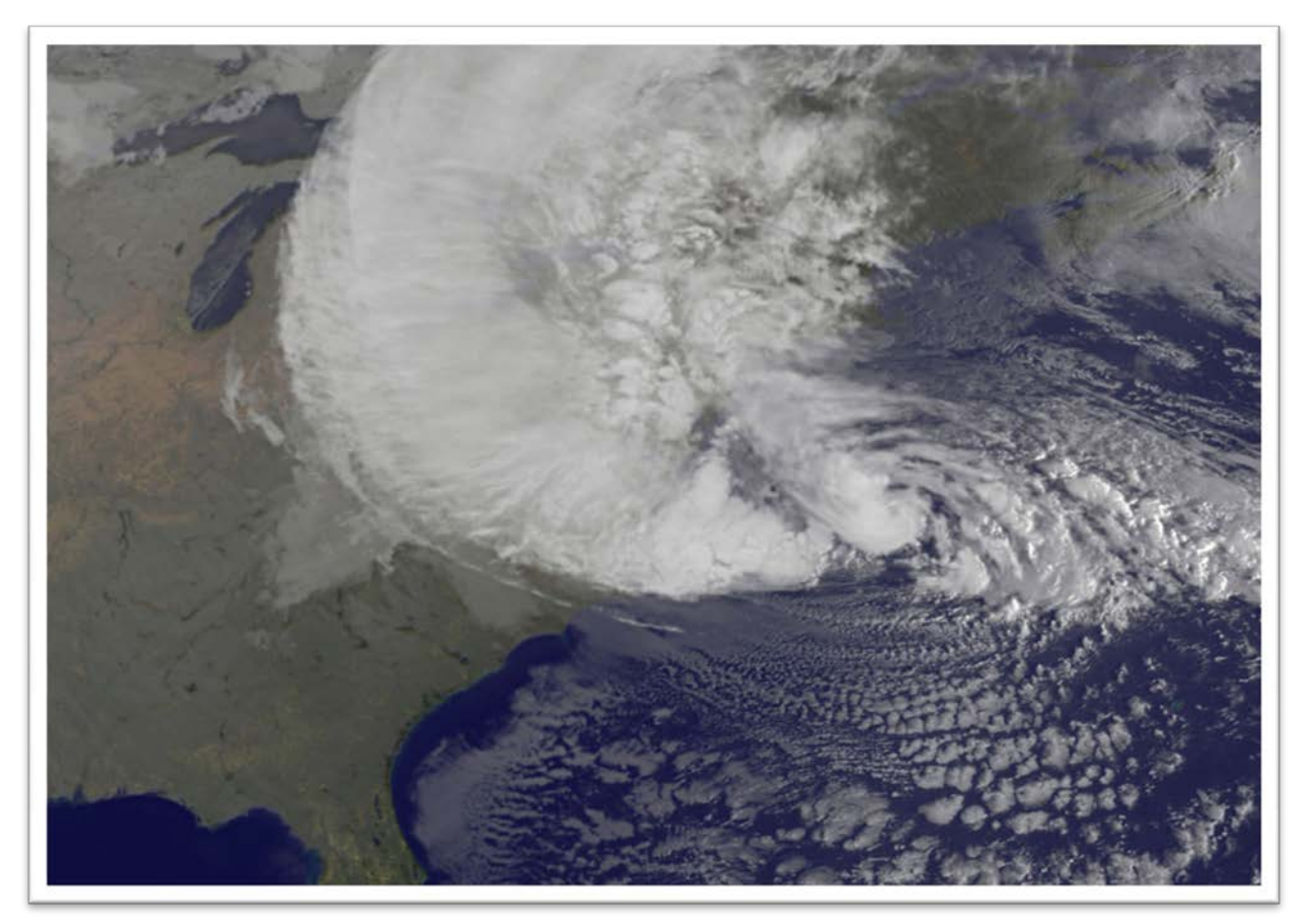
Submitted by the Assistant Secretary of the Army for Civil Works